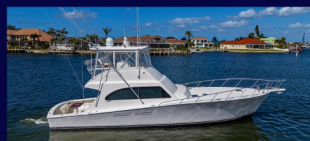
1999 Post 50 Convertible