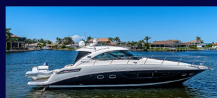
2014 Sea Ray 470 Sundancer