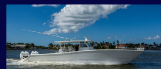
2023 Freeman 47T