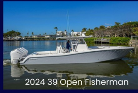
2024 39 Open Fisherman