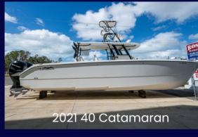
2021 40 Catamaran