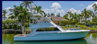
1990 Buddy Davis 61 Convertible