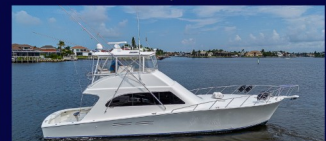
2006 Post 53