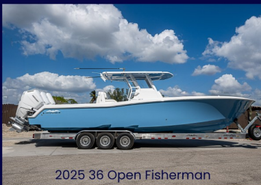
2025 36 Open Fisherman