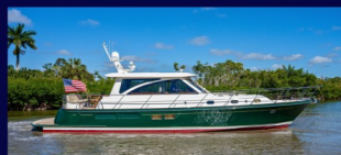
2011 Hunt Yachts 52