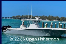
2022 36 Open Fisherman