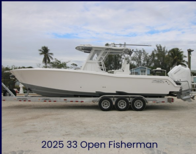
2025 33 Open Fisherman