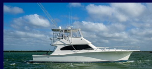
2001 Cavleer 53 Convertible