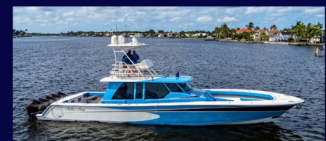
2021 Gulf Crosser 52