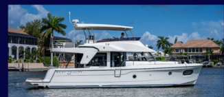
2020 Beneteau Swift Trawler 47