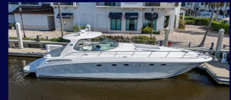
2002 Sea Ray 510 Sundancer