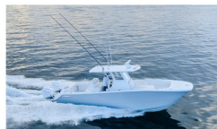
33' Catamaran - DEMO