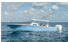
43' Open Fisherman