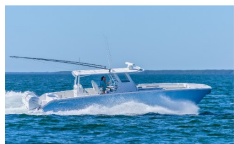
40' Catamaran - On Order