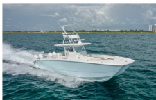
37' Catamaran - HERE NOW