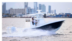
33' Open Fisherman - On Order